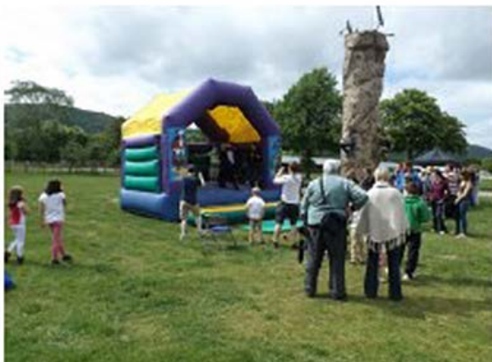
Bank Holiday Monday Fun!