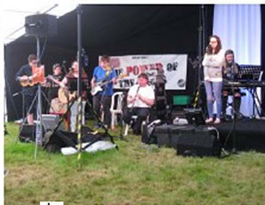
Youth and Children's Groups